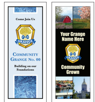
COM STYLE A COM STYLE B