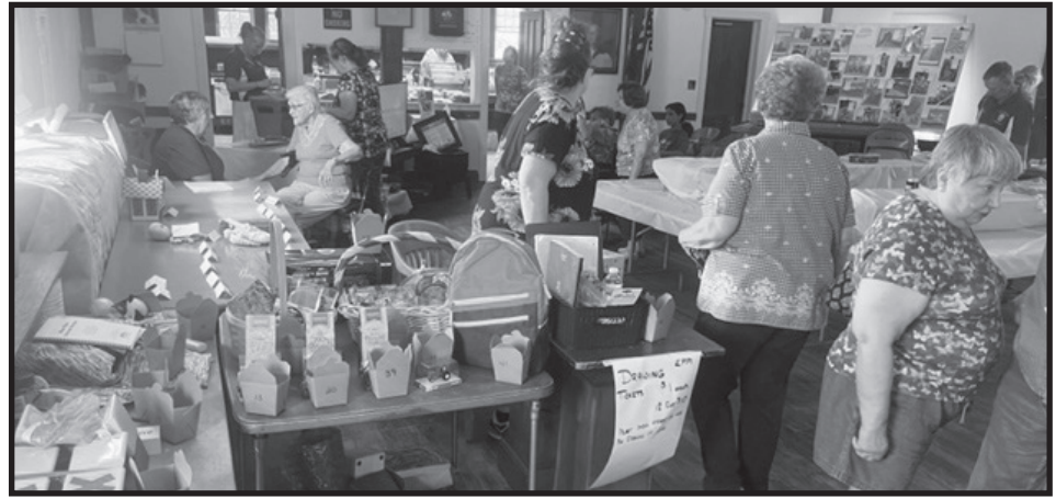
The Riverton Grange Hall was a busy place on Fair day in August.