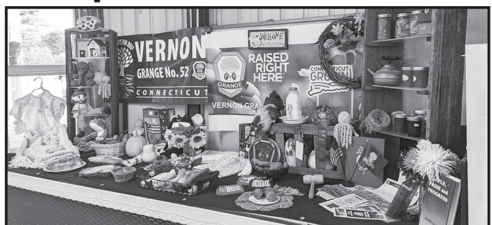
Vernon Grange No. 52 placed first with their exhibit at the Four Town Fair.