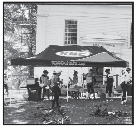
Taghhannuck pit stop during Bike Tour

Exchange), Ref. Debbie Vail Dec. 20: Meeting Omitted