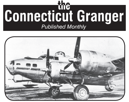
WW II Flying Fortress "Connecticut Granger"

What is remarkable about this was her ability to sell the Grange idea to the Redding community with zero personal knowledge of the Grange.