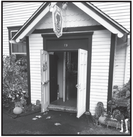
Cannon Grange was decorated for the Halloween season and for a special showing of the movie classic "The Mummy" at the hall.