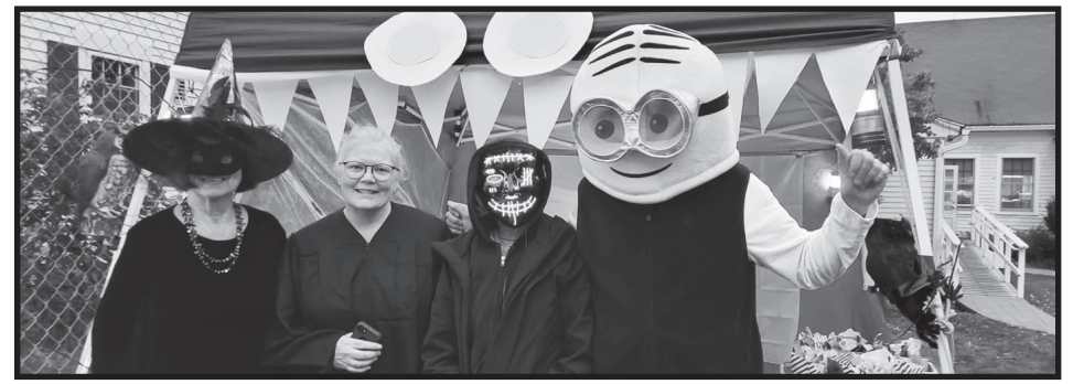
Bridgewater Grange participated in the community Trunk or Treat.

Thank you all to those who attended our November meeting.