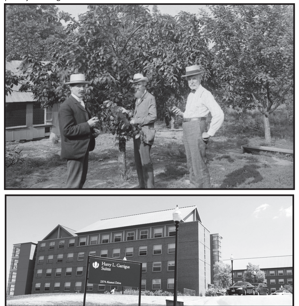
The Harry L. Garrigus Suites on the campus of the University of Connecticut, Storrs.